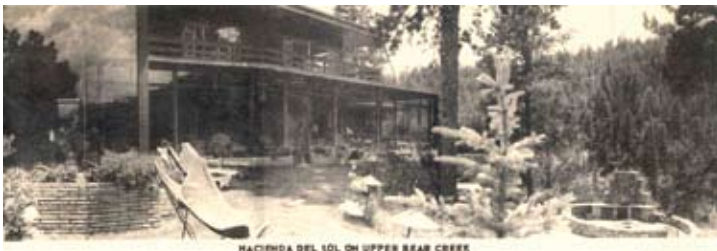
HACIENDA DEL SOL ON UPPER BEAR CREEK