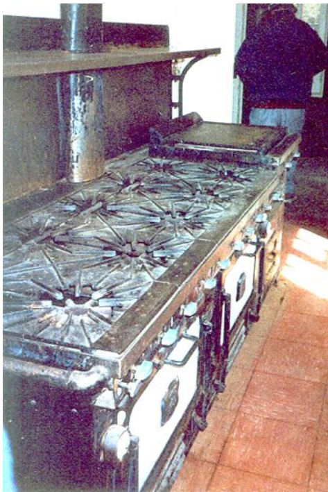
Baehrden Kitchen Stove