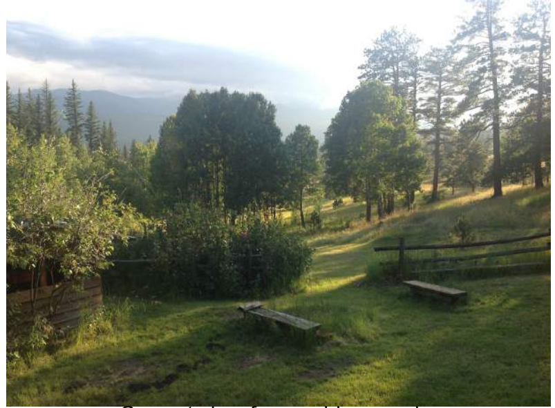
Current view from cabin porch

The original cabin guest book from this historic period is on display at the Hiwan Homestead Museum's exhibit featuring memories of WWII. Stop by and take pleasure in the presentation and rich history that Jefferson County and the mountain area contributed to the war effort during WWII.